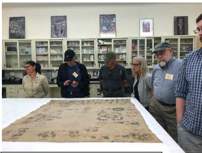
Learning about textile conservation at the Cultural Resources Center of the NMAI

After eating our box lunches in the MAC lab conference room, we journeyed back to Suitland, Maryland and the Cultural Resource Center (CRC) for the National Museum of the American Indian (NMAI). Here curators treated us to glimpses of artifacts from famous archaeological sites and discussed their work with conservation of textiles. We also visited the smudging room where Native people are able to hold ceremonies important to their spiritual understandings of the NMAI collections and the world. It was a bit of a surprise to discover how much archaeological material is held by this museum, and we were happy to learn that the curators here welcome visits from