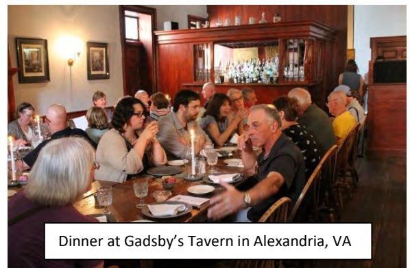
Dinner at Gadsby's Tavern in Alexandria, VA