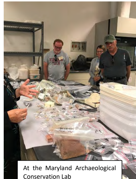
At the Maryland Archaeological Conservation Lab