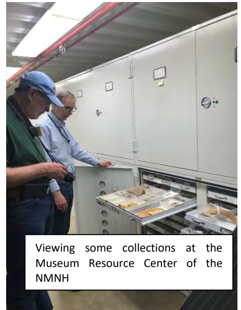
Viewing some collections at the Museum Resource Center of the NMNH

Late in the afternoon we went next door to the Museum Research Center (MRC) which is associated with the National Museum of Natural History (NMNH). This huge facility houses many of the world's largest (145 million objects) and most significant anthropological and archaeological collections, and we could only see a tiny fraction of the objects. We had short tours of the National Anthropological Archives, where they had laid out notes and documents associated with some key excavations in Pennsylvania and elsewhere. We also saw materials from the famous Neanderthal site, Shanidar Cave in Iraq, learned about procedures for DNA extraction in the ancient DNA clean lab, and got a chance to view some artifacts from several Pennsylvania sites we had asked about when setting up the tour. Although our brains and feet were tired at this point, it was hard to leave the MRC for the bus ride back to Frederick through DC traffic. Once again, there was some consolation in learning that archaeological researchers also are welcome at this facility.