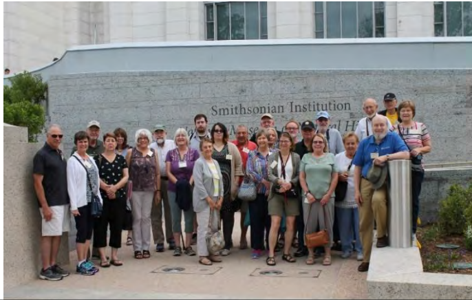
Field Trip Participants Outside the National Museum of Natural History

In the early afternoon we boarded our bus a little reluctantly for the trip home. It had been a very full weekend for all of us, and we had enjoyed each other's company. Over the course of two and a half days we also had seen some amazing artifacts and exhibits while learning about conservation techniques and research. The scope of the collections being curated was very impressive as were the technologies involved in conservation, but the possibilities for research and public education using them were most exciting. The places we visited are true treasures, and it was a privilege to have these inside tours led by dedicated curators. This was a takeaway regardless of the size and scale of the facility or the perspectives of the curators and staff. Our visits gave us a strong sense of the continuing importance of museums and their collections to our society.*