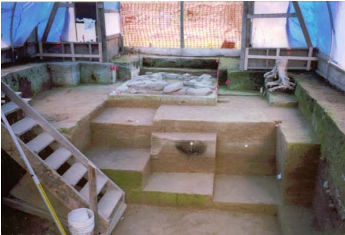
Block 17 EXT. Late Archaic Feature & Historic Foundation

The Conrail Site (36-Lu-169) is continuing on this vital research. We are working on Block 17 EXT. which has produced artifacts from the Middle Woodland to Early Archaic Periods and are constantly up-dating our statistics since the early 1990's in the preparation of an article regarding the Conrail Site. While shovel testing in area near Block 17, we have found a foundation dating to 1840's and earlier. Much more work is needed. We are planning to excavate the entire foundation area. This will be part of our chapter activity in 2009. This firmly places the site in an important early historic/prehistoric reference to its location at the juncture of the Lackawanna River and the Susquehanna River respectively.