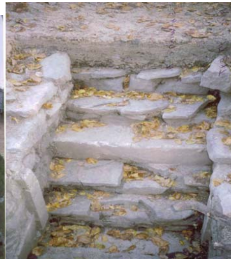
Steps into Historic Foundation

Thanks to the dedication of our chapter members and volunteers we have been able to disperse archaeology information and enabled hands-on training and experiences to both the public and private sectors of our community. Many offers have opened up to research possible privately owned sites for registration. Programs with educational institutions have involved senior graduation projects in high schools such as Wyoming Valley West High School and others, field school experience for nearby Wilkes University class students, school class field trips and project programs -(Chester Street Elementary School - Reading Program), and many youth scout groups on site visitation experiences. We have set up displays at local community events which were held up and down the Wyoming Valley and neighboring counties all year round - (OPEN HOUSE - PICNIC at SITE 36Lu169, 8th Annual RIVERFEST, Wilkes-Barre, Pa., 5th Annual NATIONAL TRAILS DAY - "HIKE AND BIKE", Hazleton,