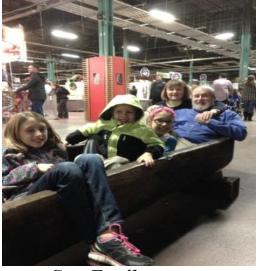
Visitors to the booth