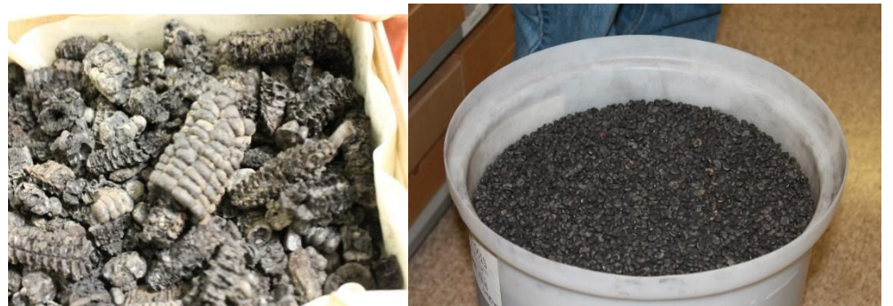
Carbonized maize cobs and kernels