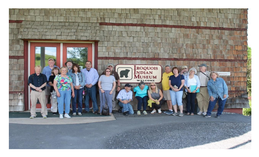
Group picture outside of the Iroquois museum.