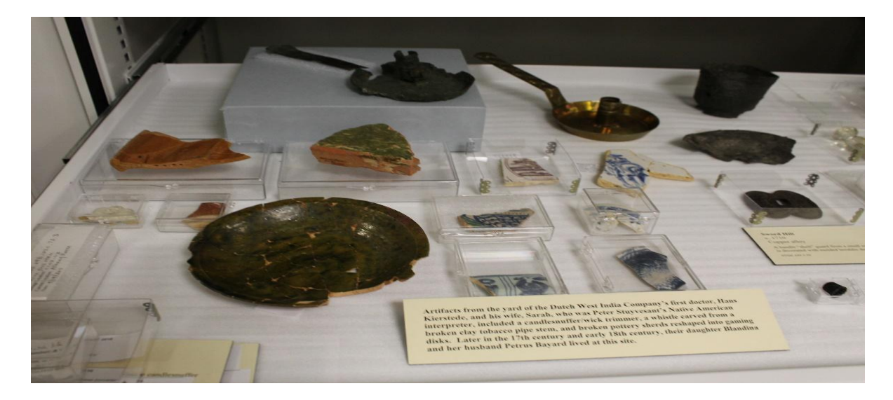
Colonial Dutch artifacts from New York